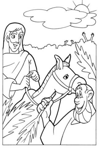
The Triumphal Entry

filled cralitude Lenten programme and Stations of the